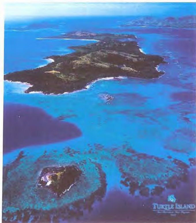
Turtle Island, Fiji

by SONA CHARAIPOTRA and NAVDEEP SINGH DHILLON