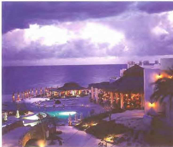
Esperanza Resort, Los Cabos, Mexico

HONEYMOON BUBBLE: Perched on the bluffs of Punta Ballena ("Whale Point") overlooking the Sea of Cortez, only ten minutes from