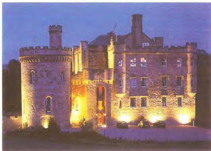
Dalhousie Castle and Spa, Scotland