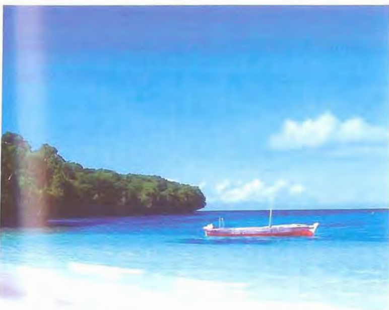
Menai Bay Bungalows, Tanzania