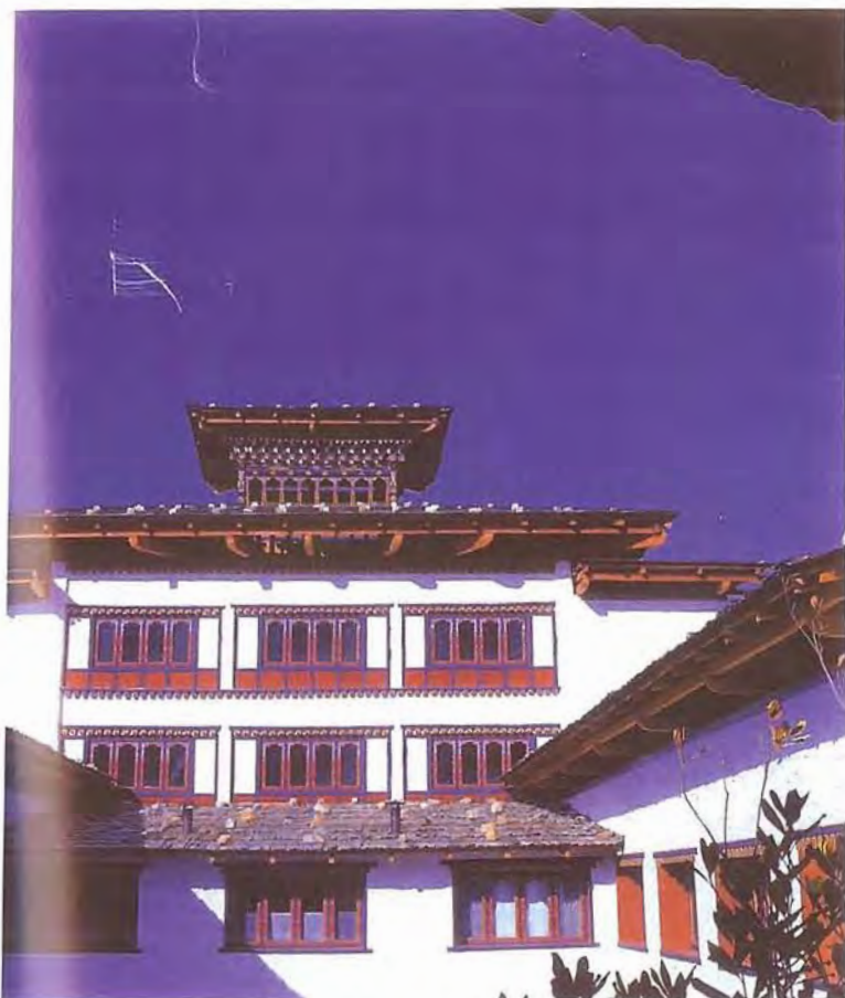
Uma Paro Hotel, Bhutan